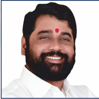
Hon. Shri. Eknath Shinde Dy. Chief Minister, Maharashtra State