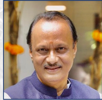
Hon. Shri. Ajit Pawar Dy. Chief Minister, Maharashtra State