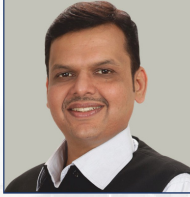
Hon. Shri. Devendra Fadnavis Chief Minister, Maharashtra State