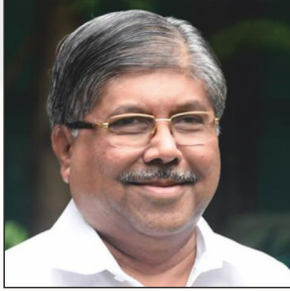
Hon. Shri. Chandrakant Patil Minister, Higher & Technical Education, Government of Maharashtra